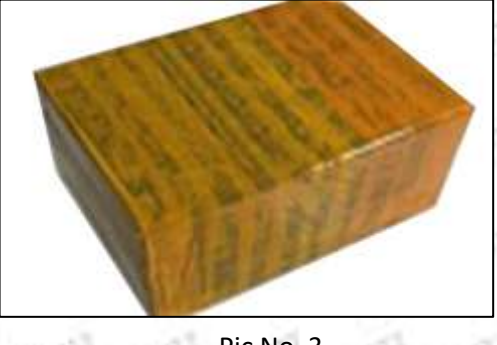
Pic No. 3 International express packaging: Wrapped with yellow tape after wrapping black protective film