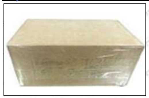
Pic No. 2 Domestic express packaging: Wrapped with Transparent tape