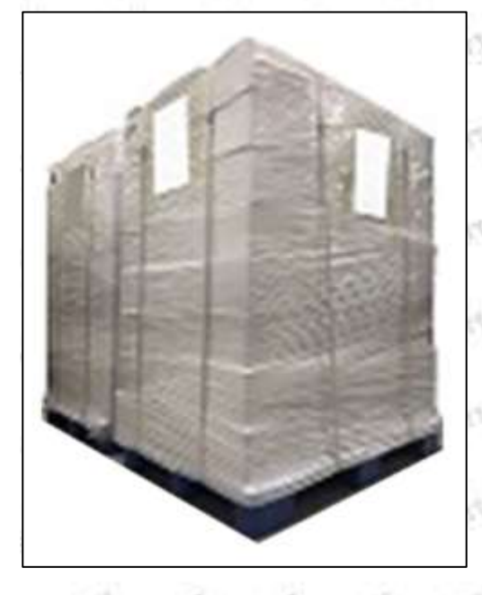
Pic No. 4

Pallet Shipping: Use pallet that meet export requirements, and use white wrapping protective film to wrap and bind with cable ties